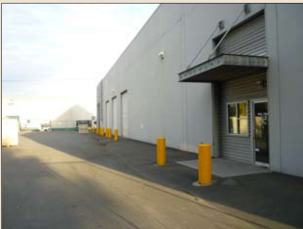
North Side - Four Loading Doors and Will-call