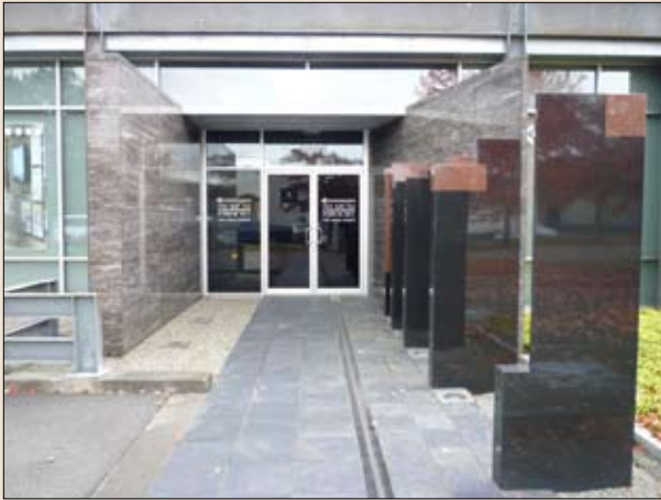
Exterior Showroom Entry