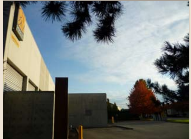
View From North of Building