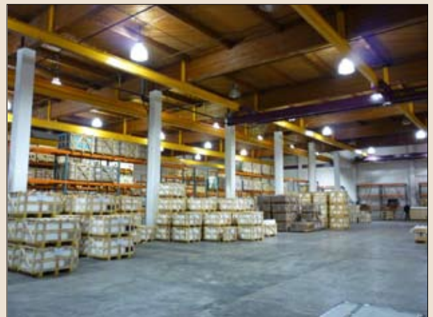
Warehouse - Showing Columns at Center and Crane Structure